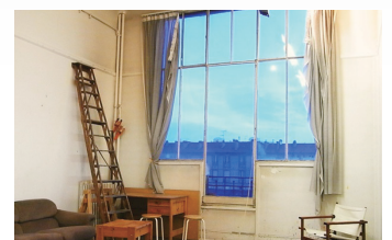
Nichido atelier in Paris